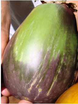
Left: Purple aubergine with green skin.

A very strange defect was that one type of pepper plant (a sweet red pepper, like a pimento) produced orange peppers. Not all the plants did this, but one plant produced only orange peppers, while others produced some orange peppers and some red ones. I asked around, but nobody had ever seen an orange pepper of this type. Nor had anyone seen purple aubergines that turned a dull green. Some of the white aubergines also had a distinct greenish tinge. All these abnormally-colored vegetables tasted quite normal, but no market gardener could have sold them to the public. I showed a green aubergine to my neighbor, and she opined that it was poisonous.