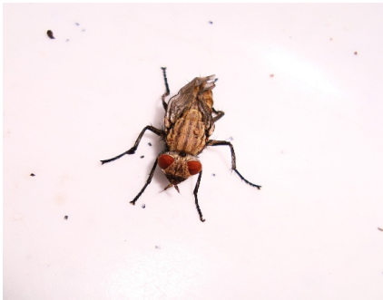
Carrion fly with deformed wings.

There ought to have been carrion flies, as well as bluebottles and greenbottles, on the corpse of the baby jackal I found late last summer. These flies lay eggs in open orifices to begin the process of decomposition, which however unpleasant, is necessary. We don't know what killed the little jackal, though a spot of blood on one foreleg suggests he might have encountered a poisonous snake. But there were no flies or any other insects buzzing around the little corpse, only a stream of tiny ants making their way to and from the open eyes. Where are these flies? We have seen very few of any of them lately.