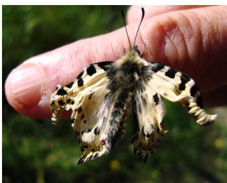
Eastern Festoon with severely deformed wings

Damage to wings is the most common visible problem in flying insects. It didn't use to be a common phenomenon. Since childhood I have watched many insects hatch and always marveled at the miracle that turns incredibly fragile, crumpled wet balls of tissue into smooth, perfect organs of flight. The miracle almost never failed. These days, it often does. In some cases this defect could be developmental damage. Most insects that hatch with damaged wings do not survive to breed, like the Eastern Festoon butterfly pictured below. There were hardly any of these butterflies last spring, and many of the spring and summer butterflies were altogether missing. Butterflies have declined rapidly since the introduction of 5G on Samos.