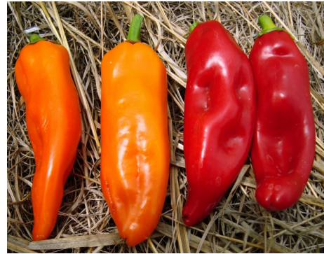
Right: The red peppers on the right have normal pigmentation. The orange peppers on the left are abnormally-colored.

Since the aubergine is a relative of deadly nightshade, it is not a pleasant thought that DNA damage might indeed turn them poisonous. At the time, I laughed at my neighbor's reaction, but now I wonder. We had a very wet autumn/early winter, and mushrooms and toadstools grew in profusion everywhere. A lot of people here collect edible mushrooms, and many are quite knowledgeable about distinguishing poisonous from edible varieties. This year, though, a great many people were poisoned by the mushrooms they collected, and some people were so sick they were sent to Athens for life-saving treatment. Now people are being warned not to collect wild mushrooms at all. People are being told that "there is something in the environment this year that is making the mushrooms poisonous".